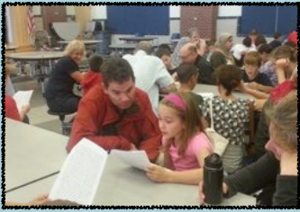
Personal narrative sharing