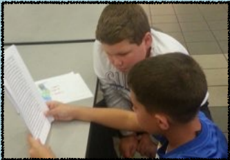
Personal narrative sharing