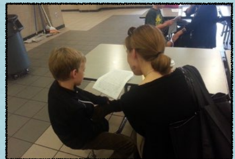
Writers were proud to share their hard work and it was wonderful to have parents their to celebrate their effort!