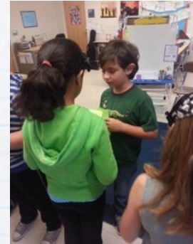
Fourth Grade Mathematicians sharing their problem solving steps!