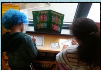
Math problem practice