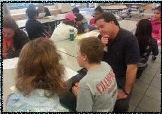
Personal narrative sharing