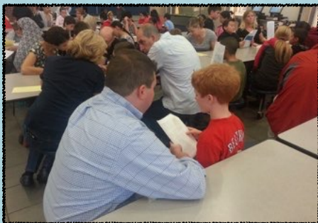
Fourth Grade Writers sharing their first personal narrative with parents and second graders!